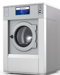
Wascomat WUD Series 30-75lb. Models Design and Construction.