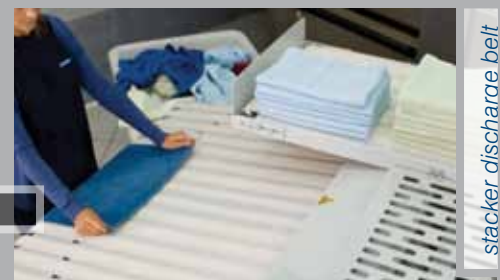
stacker discharge belt

* Product specifications are subject to change without notice.