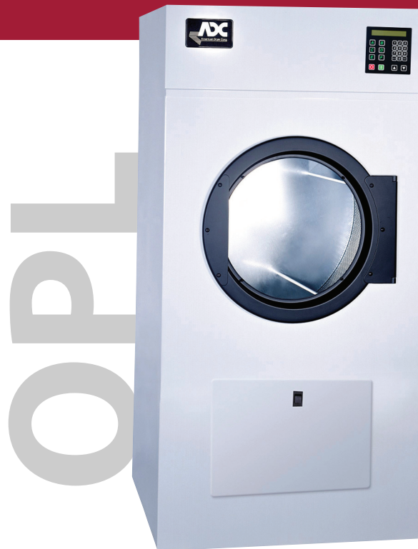
AD-30V OPL Dryer