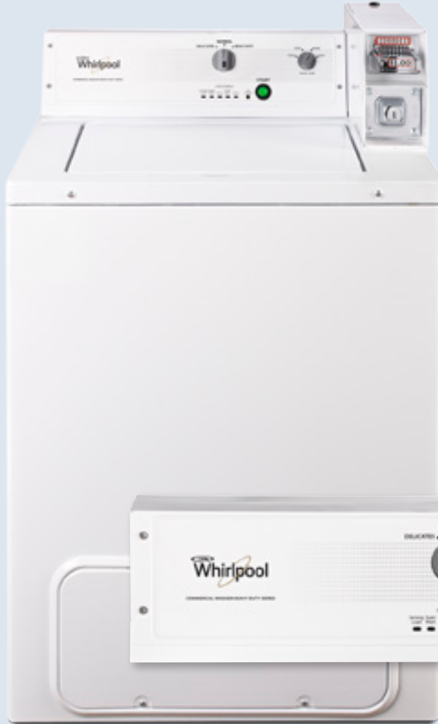
Coin slide and coin box not included.