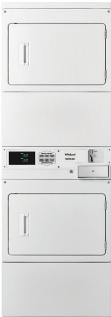
CSP2940HQ / CSP2941HQ

Why Buy: Get the capacity of two dryers in the space of only one.