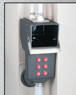
Safe chemical injection

Printed in the U.S.A. © Pellerin Milnor Corporation Brochure B22SLI4002/24302