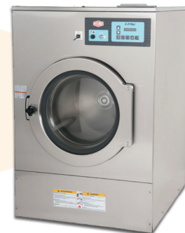
MWR36J4 with E-P Plus® control

Milnor's value-priced cabinet-style washer-extractors range in capacity from 25-80 lb. (12-36 kg). Available in three controls, these machines offer savings and flexibility—without compromising the wash quality you expect from a Milnor.