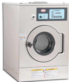
MWT16X5 with E-P Express® control

Milnor's value-priced cabinet-style washer-extractors range in capacity from 25-80 lb. (12-36 kg). Available in three controls, these machines offer savings and flexibility—without compromising the wash quality you expect from a Milnor.