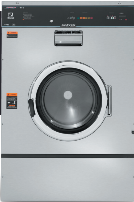
6 Cycle Control